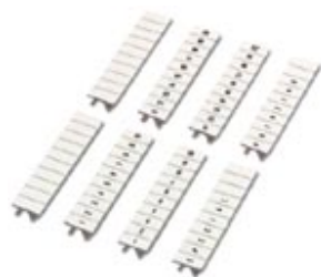
Zack marker strip, 10-section, horizontally labeled with the consecutive numbers: 31 ... 40, white, width: 5 mm

Please be informed that the data shown in this PDF Document is generated from our Online Catalog. Please find the complete data in the user's documentation. Our General Terms of Use for Downloads are valid ( http://phoenixcontact.com/download )